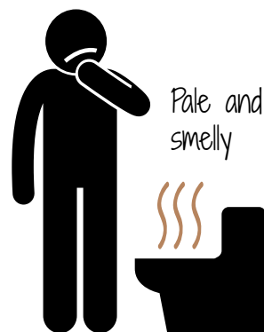
Changes in the way you poo

Where a bra strap would sit and may be eased by leaning forward